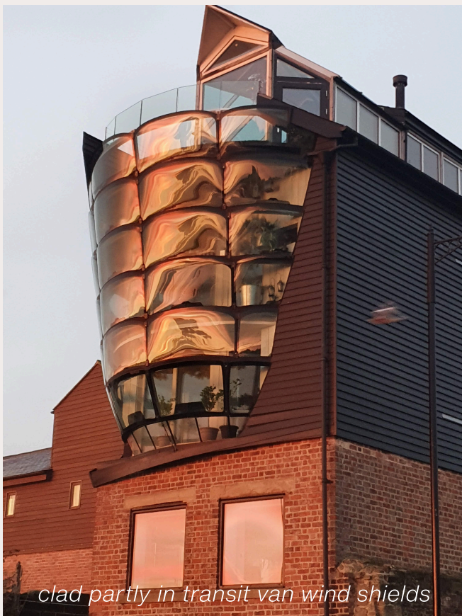
clad partly in transit van wind shields

For more information about Molten Building, follow them on Instagram , Facebook or you can watch a full interview on YouTube .