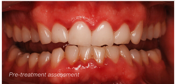
Minimal tooth tissue removal (not shaven teeth down to pegs)

We always begin with a consultation to discuss your goals, assess your oral health, and create a tailored treatment plan—with no pressure or upselling.