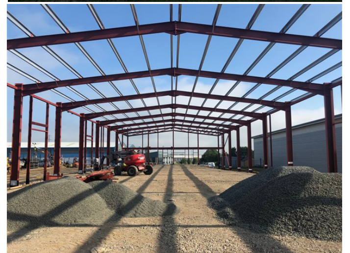
Delifresh Phase 2 - Cramlington: Design & Build project including all groundworks, carparks, retaining wall, concrete slabs and 2 storey office fit out.