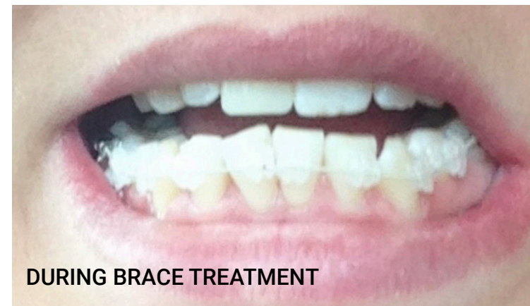
DURING BRACE TREATMENT

When I came in for an implant and I just happened to kind of throw it out there that I might want braces and we discussed pricing and found out it was actually an obtainable thing.