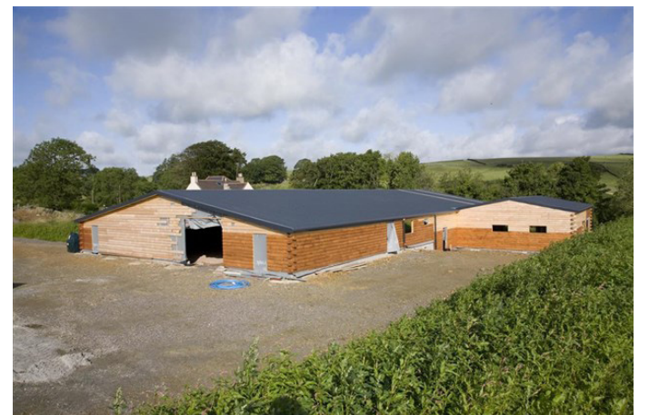
Cocoa Bean Chocolate Factory in Dumfries & Galloway