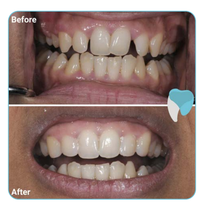
These two cases were fixed brace treatments.

Fixed braces are perfect for larger movements needed to correct teeth that are out of alignment, this is because they are not removable and are made from very strong material. Fixed braces are now also made out of discreet material, making them nearly invisible.