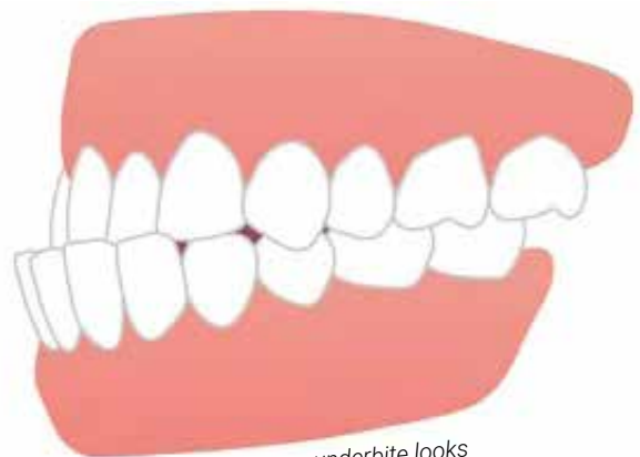
example of how an underbite looks

Remember, correcting an underbite requires patience and commitment. But with the proper treatment, you can improve your oral health and achieve a healthy, beautiful smile.