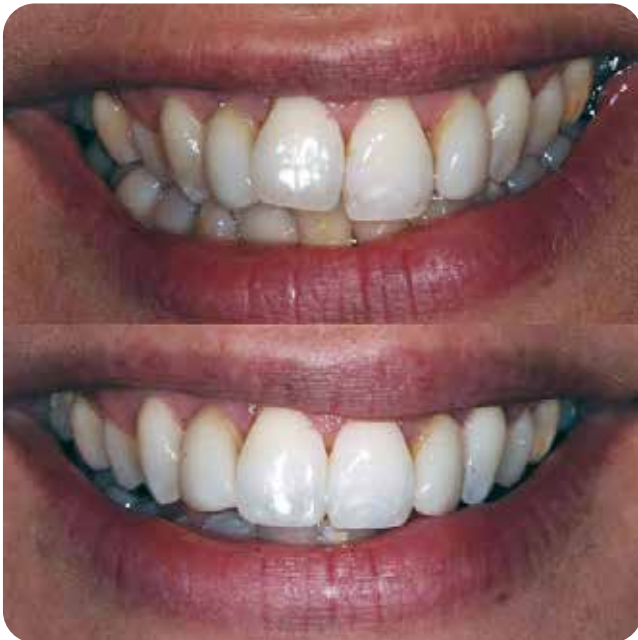
Orthodontics and Bonding