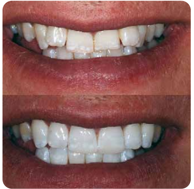
Orthodontics, Whitening, Bonding