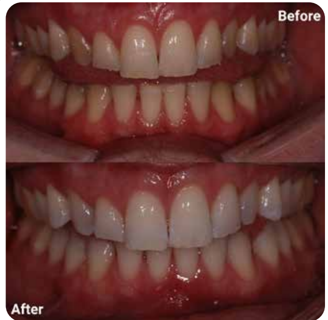
Regular Hygiene Appointments & Teeth Whitening