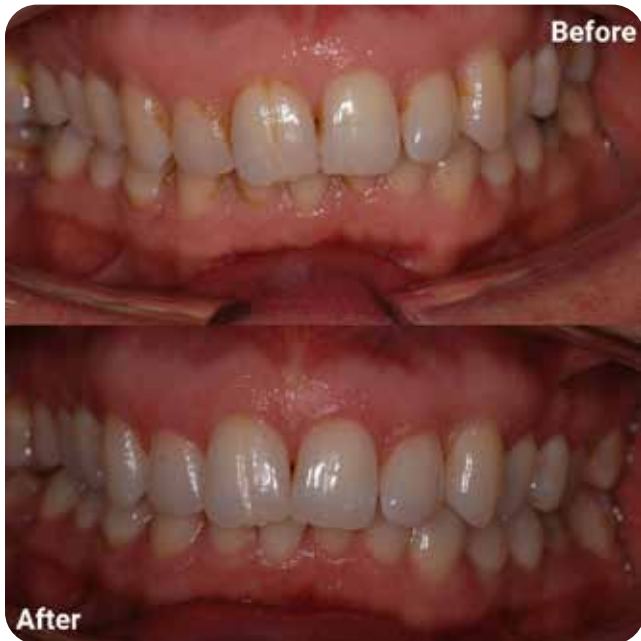
Regular Hygiene Appointments & Teeth Whitening

Some of our favourite before and after photos from last month.