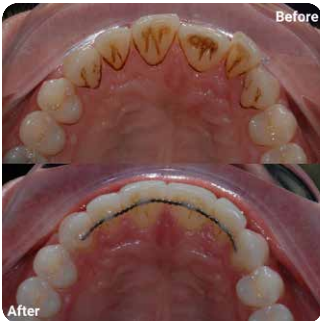
Orthodontics, Bonding and Whitening